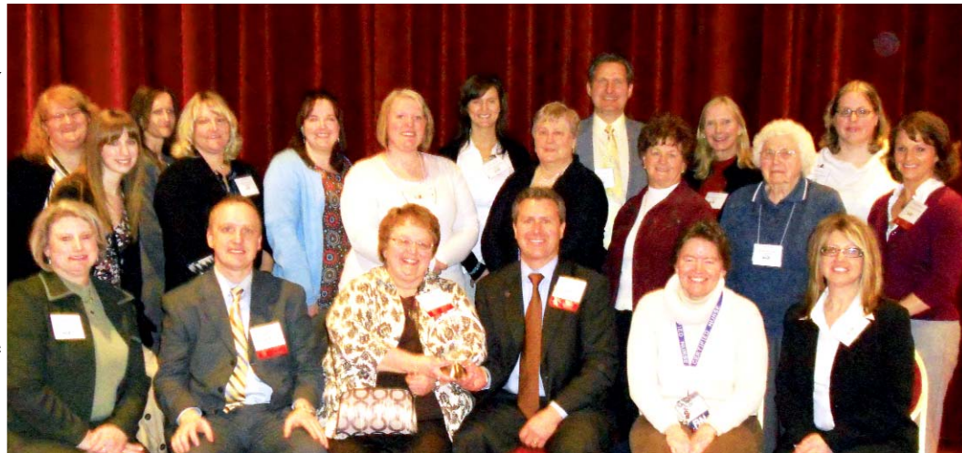
Ministry Saint Joseph's Hospital and Partner's with Saint Joseph's Hospital were well represented, as 20 employees and volunteers attended the event.

Advocacy All-Star Award. This is awarded to one Wisconsin hospital each year for their grassroots advocacy efforts. MSJH had significantly increased its HEAT participation in 2010 and for that I want to personally thank each and every one of you who have been part of this grassroots effort.