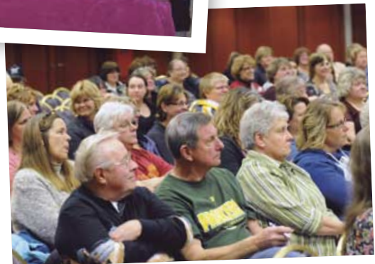
(Right) Over 800 participate in the Community Weight Race.