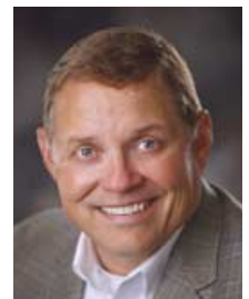
Cliff King Skyward Inc.