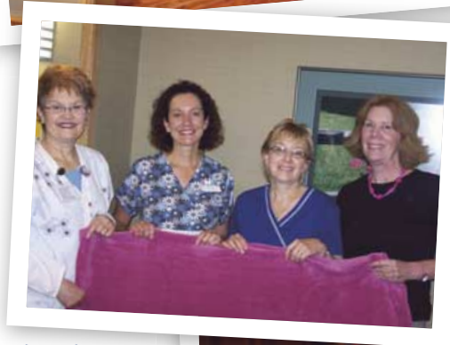
(Above) Project Embrace™ provides warm blankets to oncology patients.