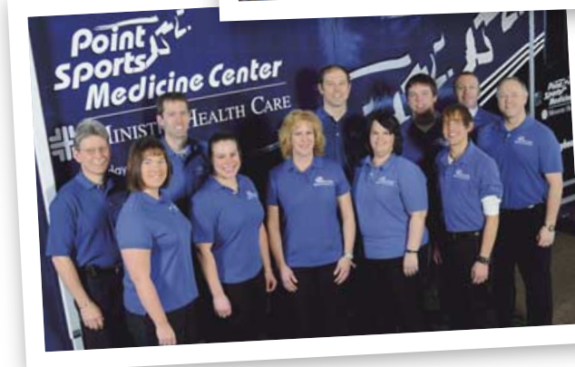
(Left) Ministry Point Sports Medicine Center staff work to help schools and athletes understand the severity of concussions through Immediate Post-Concussion Assessment and Cognitive Testing, or ImPACT.