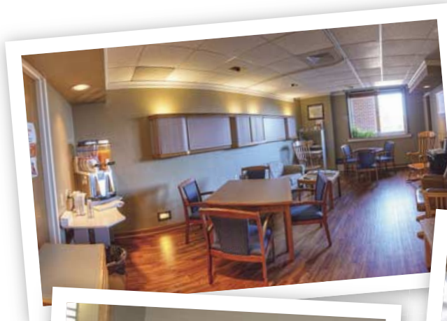
(Left) The newly remodeled Women & Infant Center lounge.